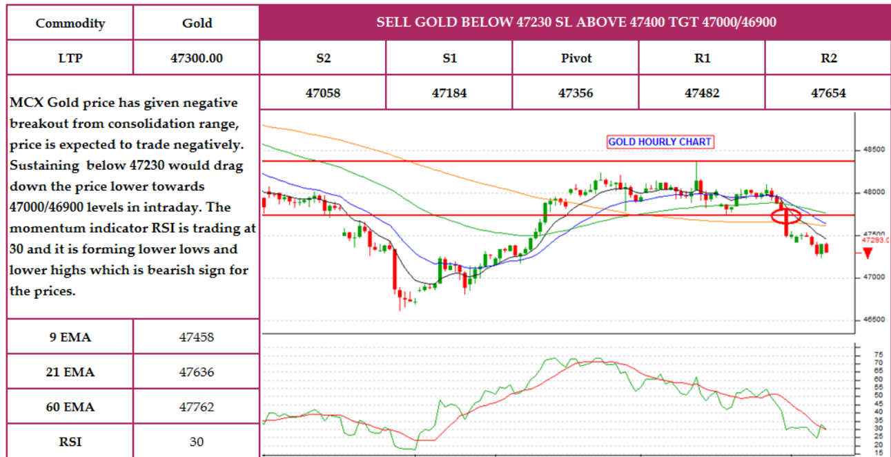
Chart of the days